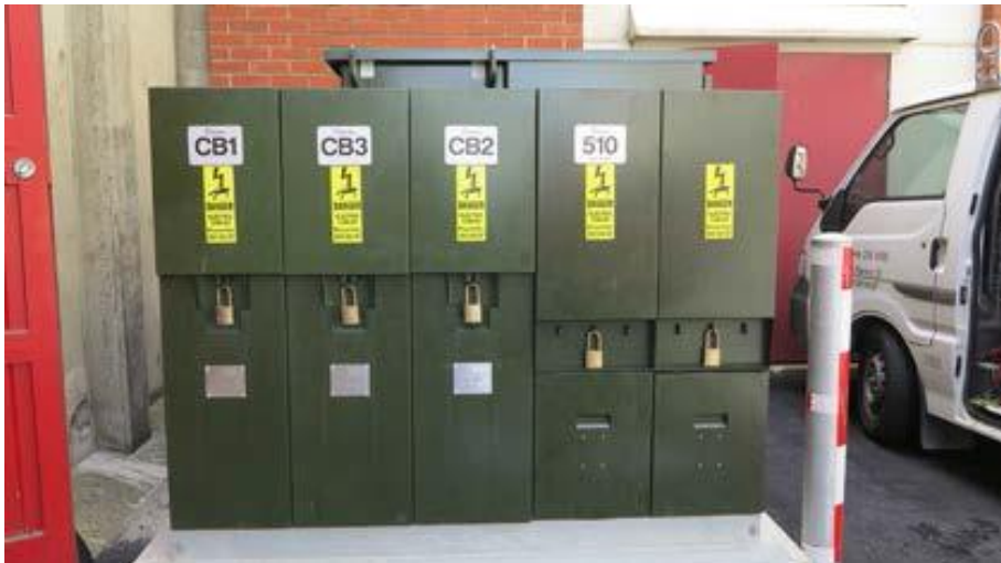
Top: The old 1962 750kVA transformer being lifted above ground outside the Kelvin Hotel in Invercargill.