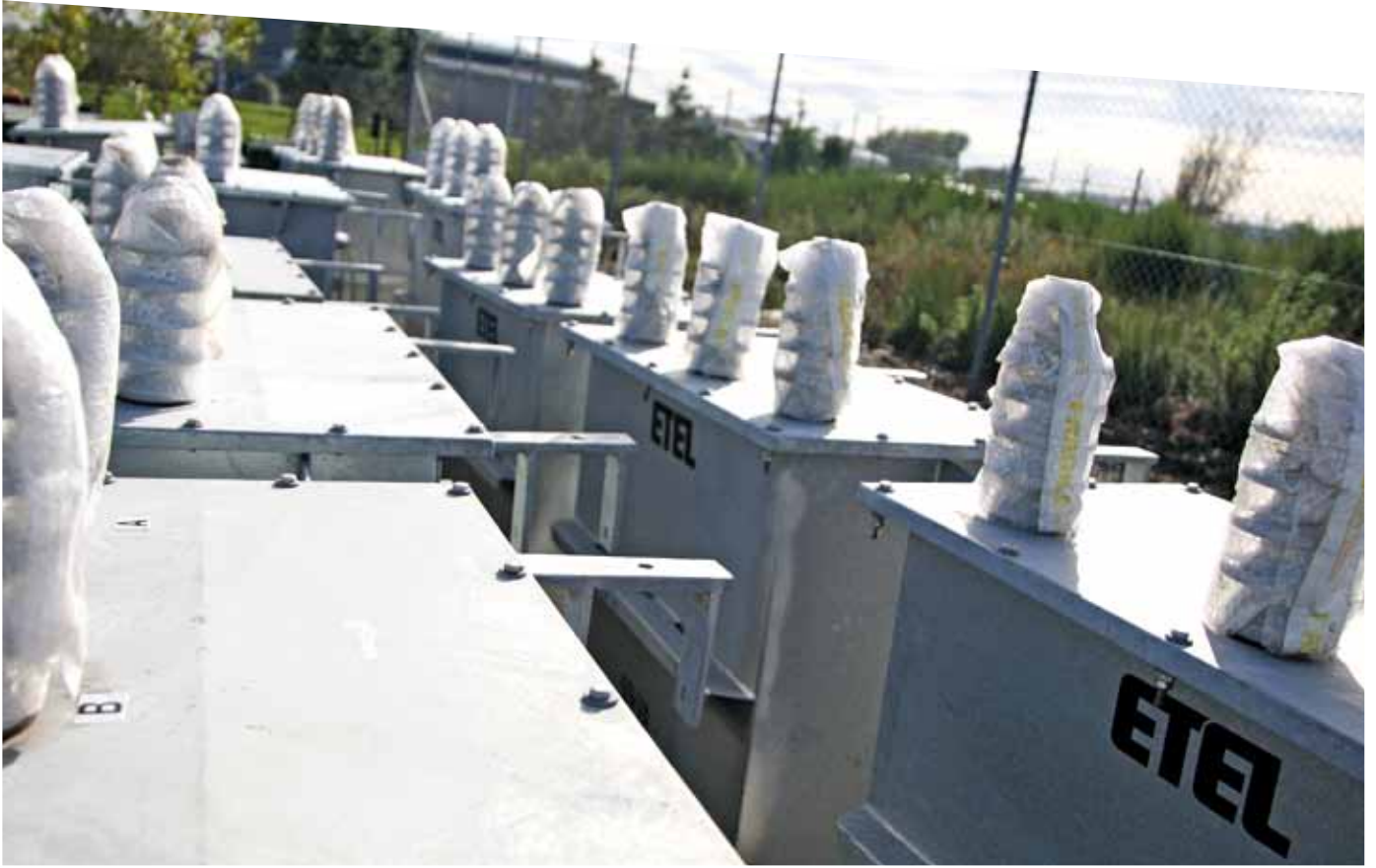
Transformers at Corys