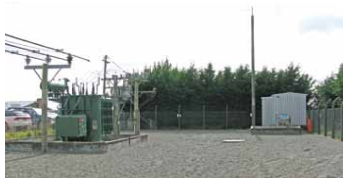
Kennington Substation Before and After the upgrade