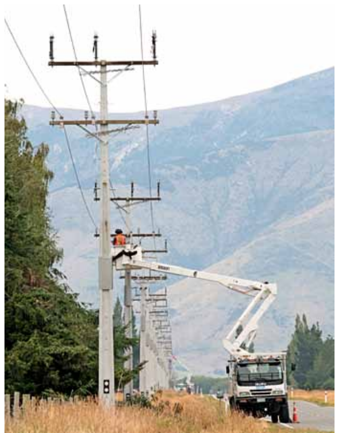
Delta Utility Services working on the Mossburn to Athol line upgrade