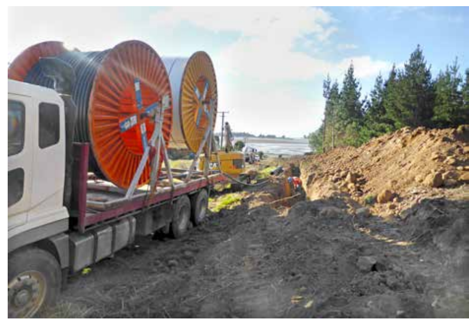
Staff from Otago Power Services laying cable on Manse Road

A new substation – a replacement for the existing Waitati Substation - is scheduled to be constructed in Manse Road in 2020/2021. The substation will increase the reliability of supply and cater for the continuing load growth in the region.