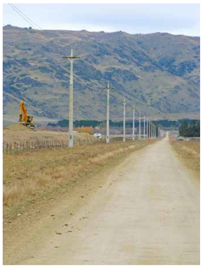
The new 11kV line on Maniototo Road

Particular considerations with the installation of power lines in the area include the need to take into account the region's extreme weather conditions. Factors such as the pole loading capacity for snow are important in ensuring that the impact of harsh weather events is minimised.