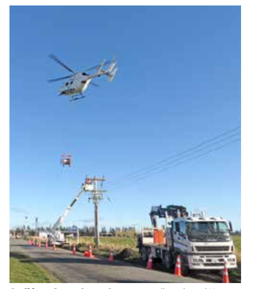
Staff from Otago Power Services installing the 66kV conductor on the new 66kV line

This project commenced in January 2015 and was completed in September.