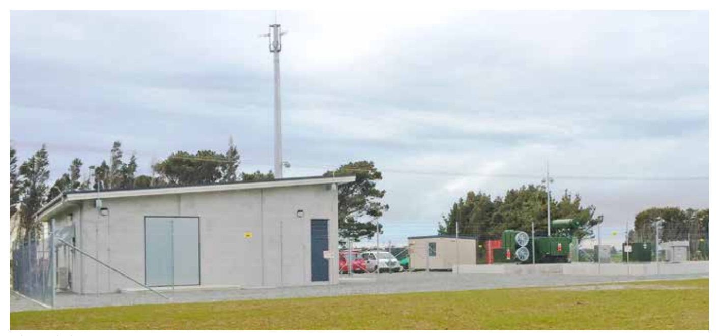
Colyer Road Substation

"PowerNet has an ongoing commitment to ensure customers on The Power Company network receive a safe, efficient and reliable electricity supply. The capital investment for the network is between $20-$30 million per annum, with a significant proportion of that spend dedicated to new and upgraded network assets," Jason says.