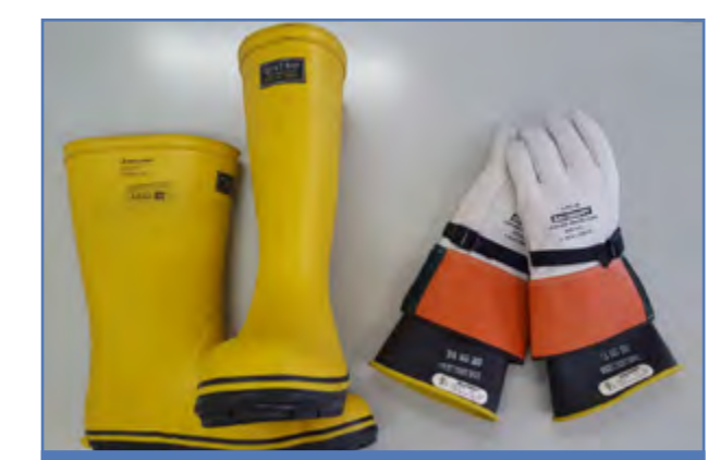
Dielectric-rated boots and high-voltage gloves

Manufactured by Skellerup, the specially-insulated yellow rubber boots were invented and tested for proof of concept in New Zealand, and the rubber gloves are designed to avoid electrical shock from touch hazards.