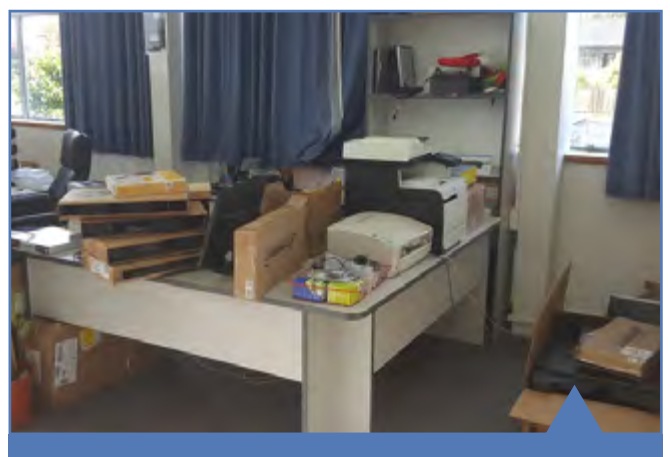
AJ Cross's desk before 5S

5S is part of PowerNet's five-year Lean Management journey which aims to eliminate waste, streamline processes, focus on continuous improvement and overall improve the workplace.