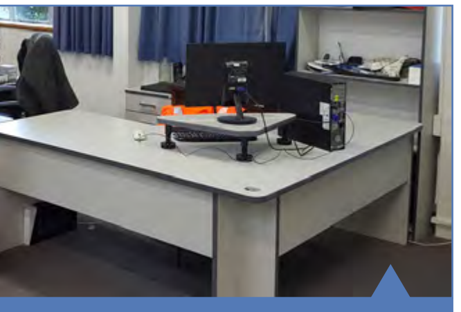
And after 5S