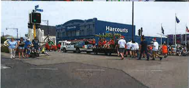
Above: Invercargill Santa Parade on Saturday 30 November.