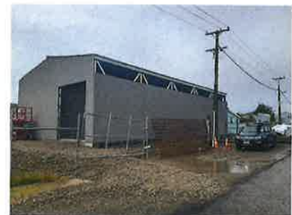
Lumsden Depot rebuild scheduled for completion by Christmas.