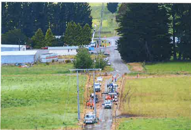
PowerNet staff and contractors installing the 66kV conductors across the Oreti River.

Seventy-six kilometres of 66kV lines have been installed or upgraded and four substations (Centre Bush, Dipton, Lumsden and Mossburn) rebuilt or upgraded. A new microwave network has also been installed to provide fast protection operations between substations.