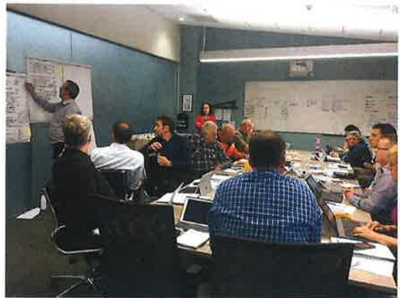
The crisis management team working through 'Exercise Rata'.