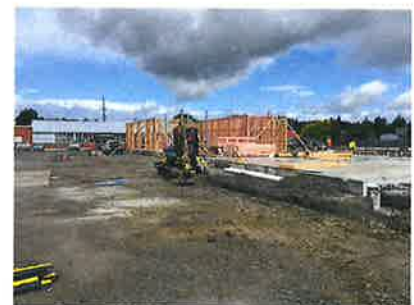
Balclutha rebuild - L/R: demolition of the old building, foundations laid, framework now underway for the office building.

Rachael said the new Lumsden Depot build was also progressing well.