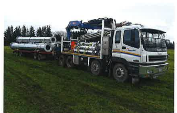
One of the four 38m steel towers being delivered to the Oreti River site to be installed.

"Completing this project means TPCL is well-positioned for increases in energy use and electrification," Mr Fraser says.