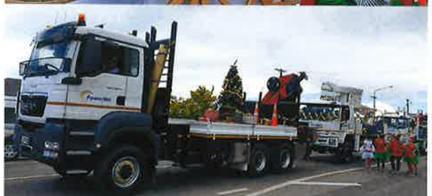
Above: Balclutha Santa Parade on Saturday 7 December.