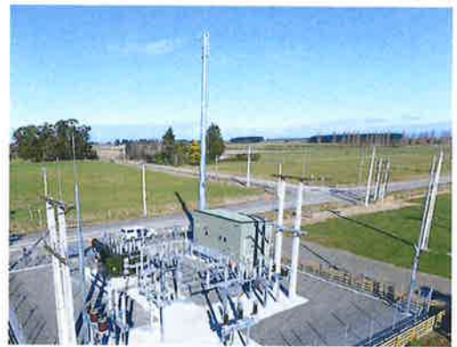
The upgraded Centre Bush substation.