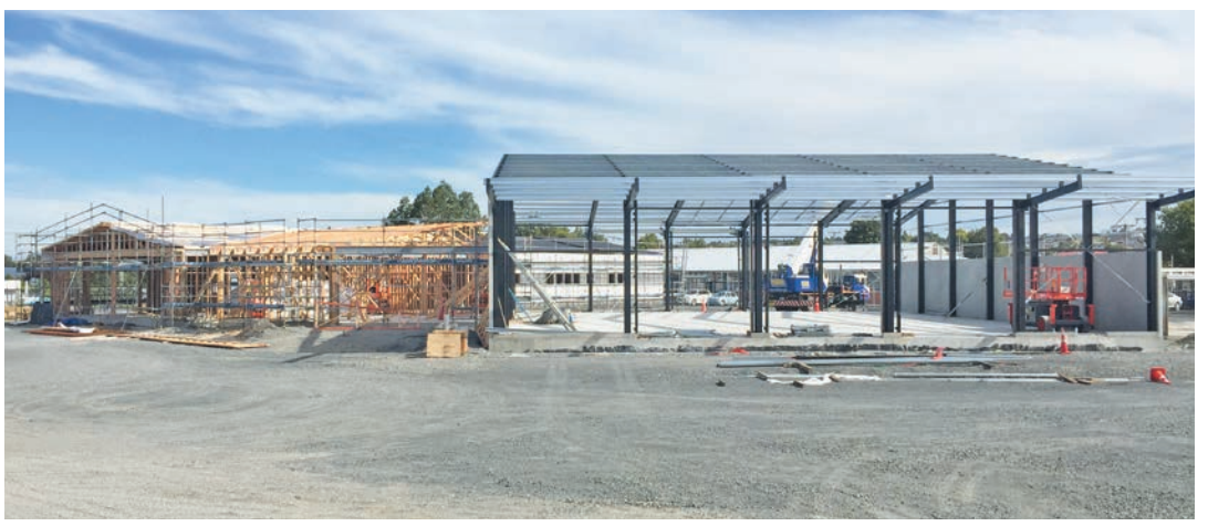
Construction of PowerNet's new office and workshop at Balclutha.

"We've been able to use local and Otago based firms in this project which is good for the local economy. Work is progressing well, with multiple crews on site now as the building takes shape," says Terry.