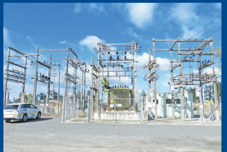
The Finegand substation.

The upgrade is scheduled for completion this year.