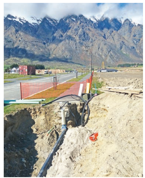
Cable trenching at Hanley's Farm.

This large-scale subdivision work on the ESL network has provided new opportunities for our cable jointing staff from Invercargill and Balclutha to acquire new skills. They've been able to learn more about the techniques necessary for working on larger sites, operating alongside our highly skilled Queenstown based cable jointers.