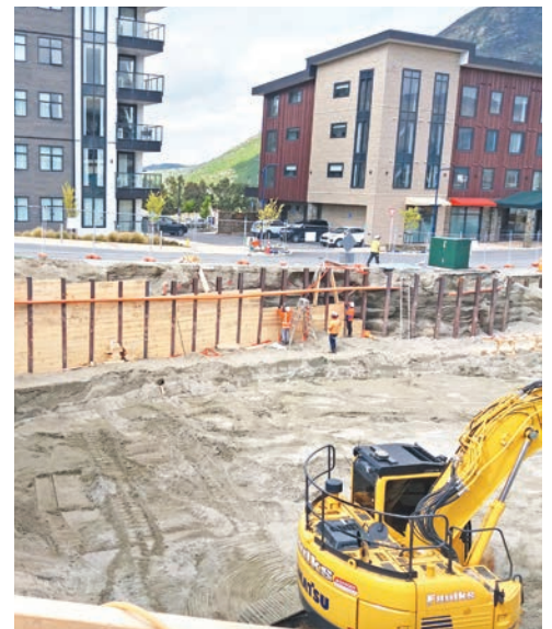
The basement work next to the high voltage supply cables and ring main unit that will supply Lakeview Gardens Hotel.